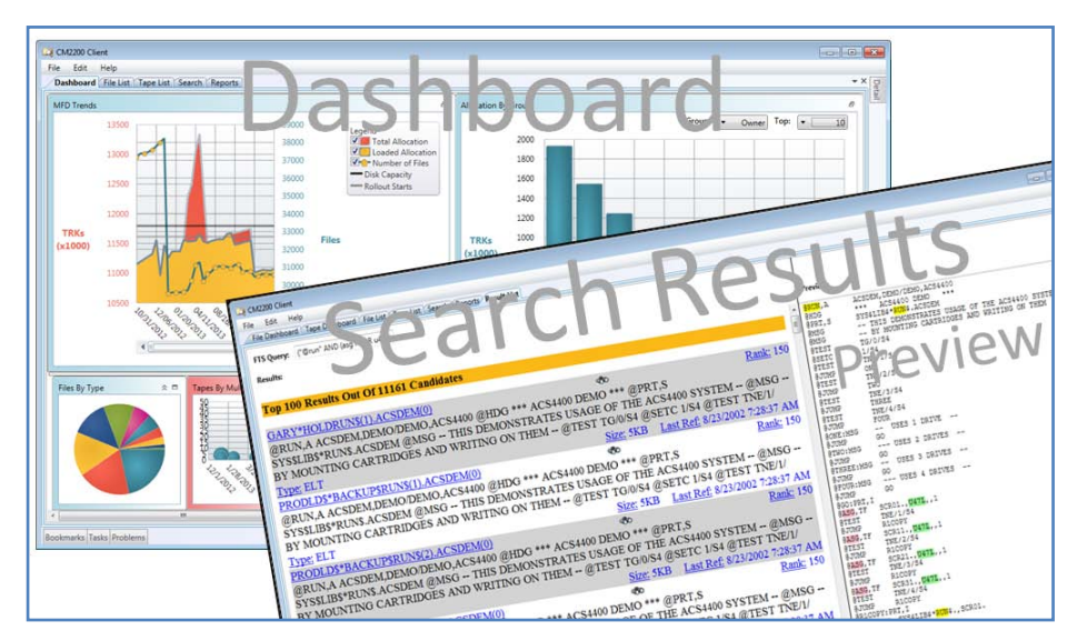
Top-Down or Bottom-Up Tools for CTOs, Managers, and Programmers

Aside from daily maintenance duties, ESP-Dorado can also assist in preparing for tomorrow's projects like satisfying an SOA initiative, implementing new technology, or assisting a new team during acquisition.